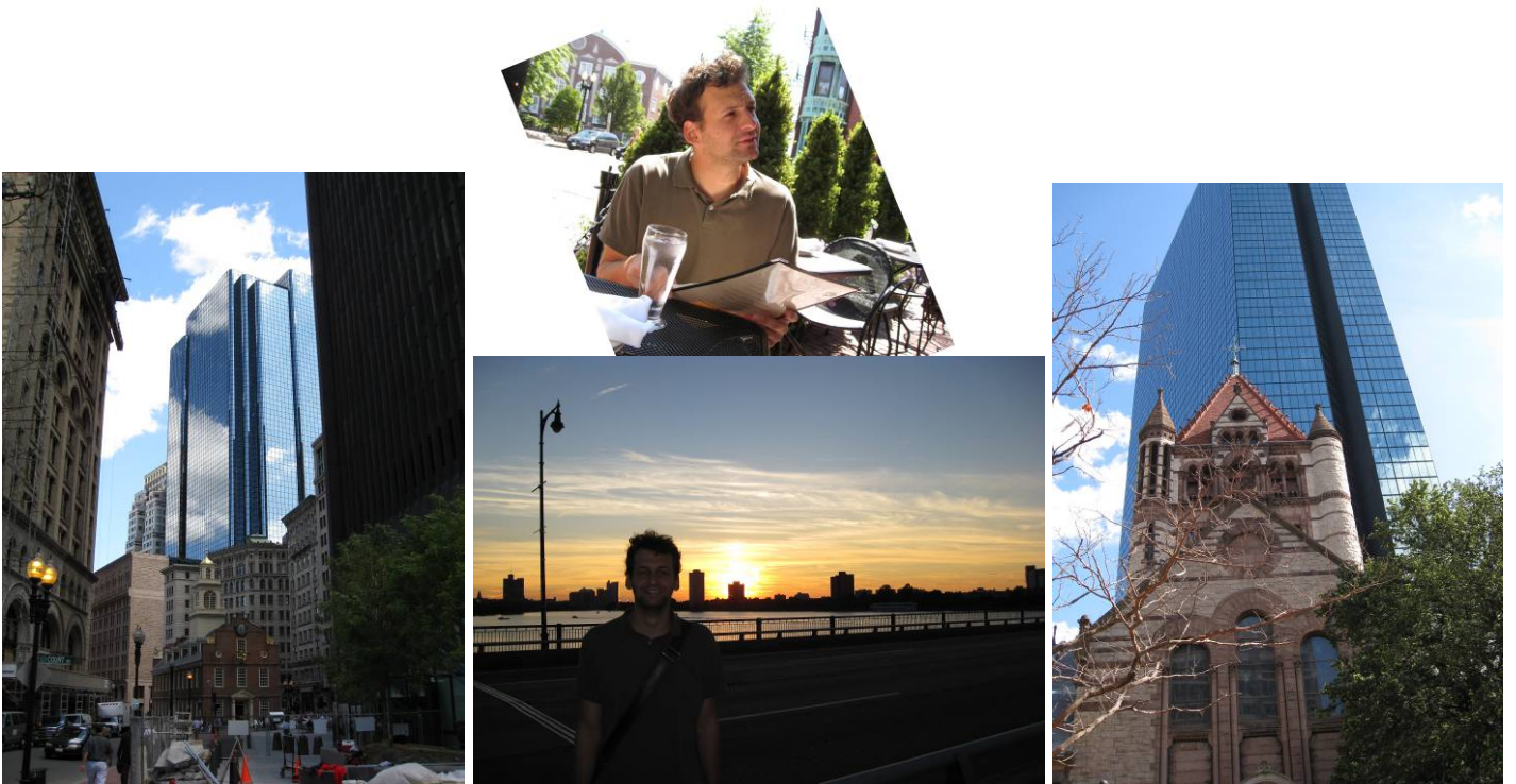
A good photographer this guy – a questionably decent motive himself though ;-)

Thanks man, I had a LOT of fun with you!!