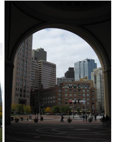
...and some more images from Boston.

Thanks to the people who visited... it was a hilarious time and a great pleasure!!!