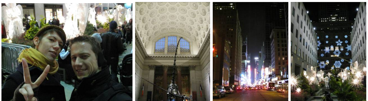
NY, exciting as usual. http://www.berndresch.com/pictures/0811_new_york/index.htm