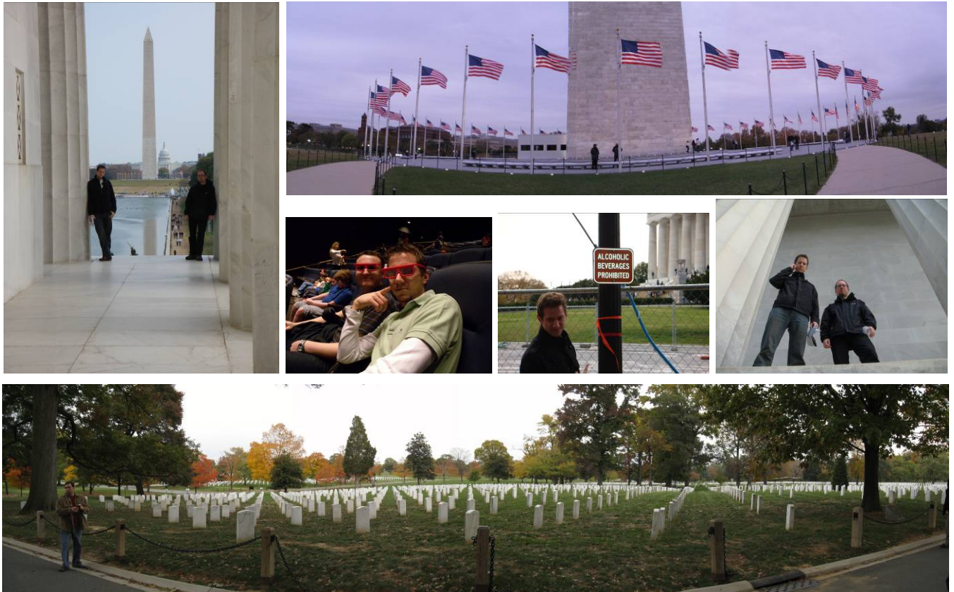
Washington – an amazing city! And amazingly dead (in terms of going out and social life). http://www.berndresch.com/pictures/0811_washington/index.htm