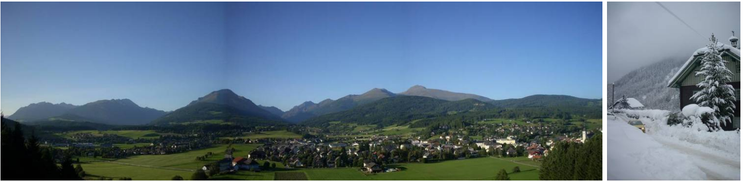
What can I say – home sweet home (left: September; right: December).